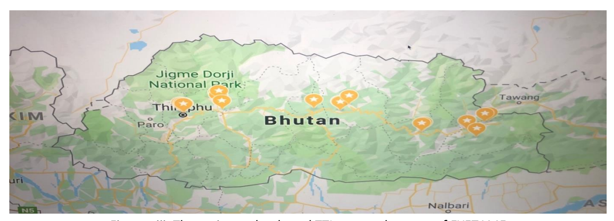
Figure viii. The various schools and TTIs covered as part of EYETAME