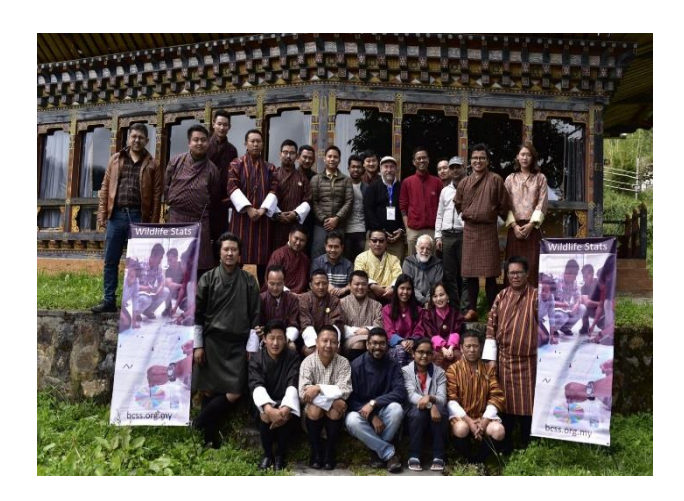
Figure xv: (i) Elf camp participants (ii) Boot camp participants