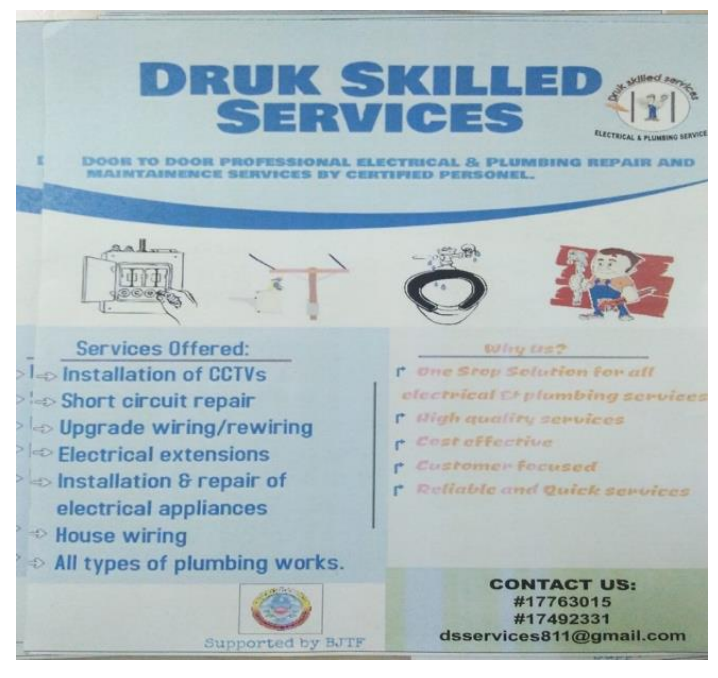
Figure X. Druk Skilled Service - TTI Youths