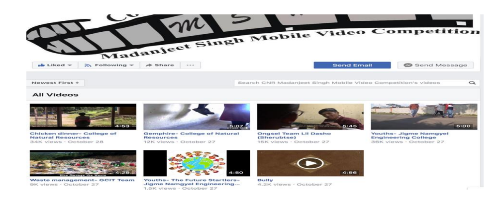
Figure xiv: Screenshot of the video entries of mobile video competition

A total of seven video entries participate in this year's competition, two from CNR and five from other Royal University of Bhutan Affiliated colleges. The video competition is sponsored from the UMCSAFS program fund.