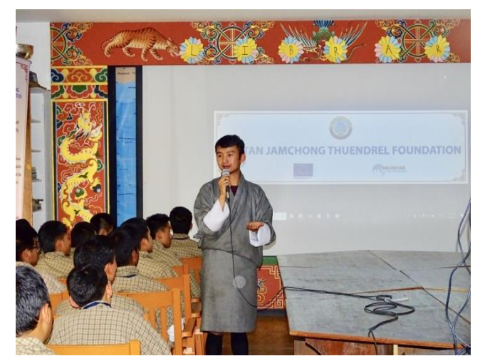
Figure vi. Some snippets from our advocacy and awareness program at various schools

For TTIs, partnerships programs were held for promotion of entrepreneurship among the trainees and highlighting the importance of skilled jobs in the 21<sup>st</sup> century. BJTF entered into partnership with four TTIs through the signing of MoUs. The main objective of the partnership is to facilitate the interested TTI students in setting up skilled businesses.