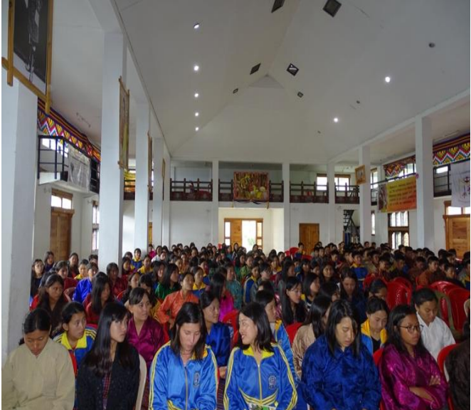
Figure ix. Students attending the advocacy and awareness program